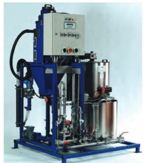
With its 3-step mixing regime, polymer particles cannot pass the PolyRex process without being activated. The unit is easily operated and adjusted using the touch screen display on the control panel.

“We use a nuclear density gauge to determine the percent solids of scrubber slurry coming into the holding tanks at our paste plants,” says the plant’s system engineer. The holding tank