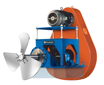
PB Mixer Combines the proven features of the MD series with the simplicity of the pillow block bearing design.