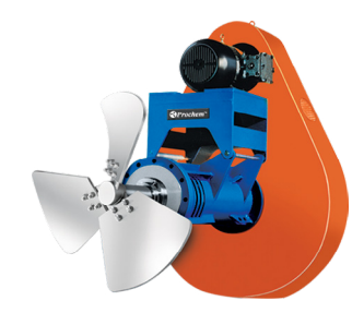
MD Mixer Side entry belt driven with a modular bearing cartridge design allowing longer operating runs between maintenance periods.